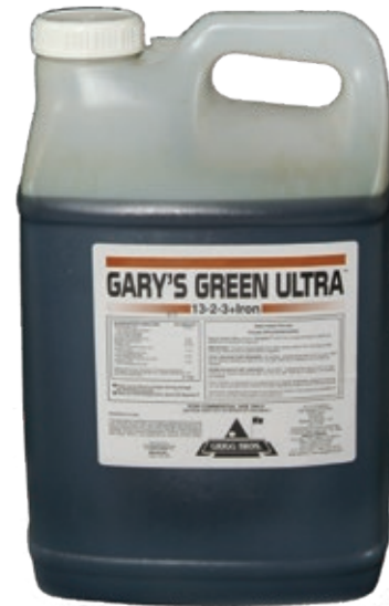
1 U.S. Gallon, Net Weight: 10.68 lbs/3.78 Liters/5.18 kg Specific Gravity: 1.28, pH: 3.7

Derived from urea, ammonium phosphate, potassium phosphate, potassium nitrate, magnesium sulfate, iron, copper, manganese, zinc glucoheptonates and kelp.