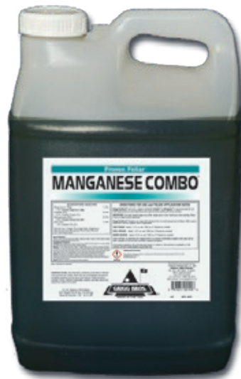
1 U.S. Gallon, Net Weight 11.27 lbs/3.78 Liters/5.11 kg Specific Gravity 1.35, pH 2.38

Derived from magnesium, manganese, copper and zinc glucoheptonates.