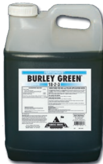
1 U.S. Gallon, Net Weight 9.93 lbs/3.78 Liters/4.50 kg Specific Gravity: 1.19, pH 8.8

Derived from urea, ammonium sulfate, ammonium phosphate, triazone, potassium phosphate, and phosphoric acid.