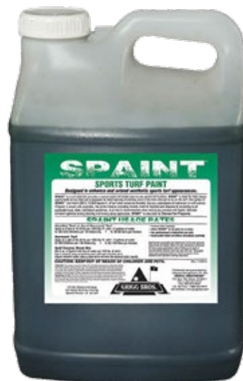
1 U.S. Gallon, Net Weight 9.85 lbs/3.78 Liters/4.47 kg Specific Gravity: 1.18, pH: 8.0 - 9.0

Mix 6 oz (177 ml) of Spaint with 8 oz (237 ml) of water per 100 lbs. (45 kg) of sand. Use a cement mixer and slowly pour colorant onto the sand. Adjust colorant water ratio as desired to achieve the desired color.