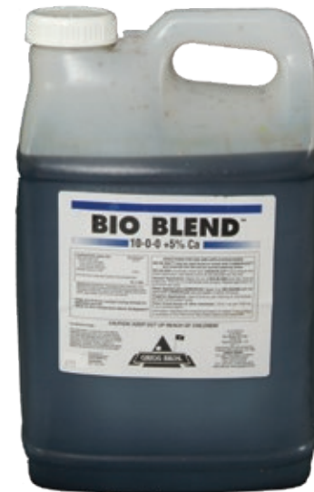
1 U.S. Gallon, Net Weight: 11.02 lbs/3.78 Liters/5.00 kg Specific Gravity 1.32, pH: 1.00

Derived from urea, ammonium nitrate, calcium nitrate.